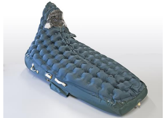
The Airsafe 510 single seat life raft

Second-to-none in combination with a HAHO parachute system, the Airsafe 510 Life Raft is a safe backup causing minimal obstruction when attached to the harness.