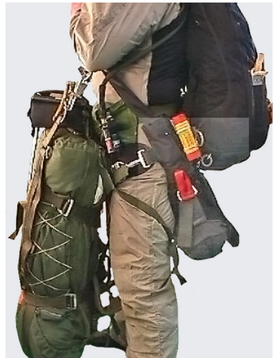
Attaches to the bottom of the harness