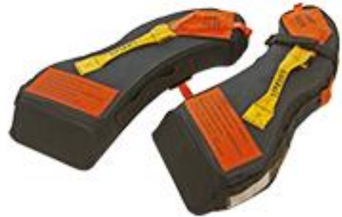
Compact design for space saving stowage

Your Airsafe 520 Life raft comes as a portable unit ready for use, offering first-rate seaworthiness whilst providing insulation and protection from the elements to the person in distress.